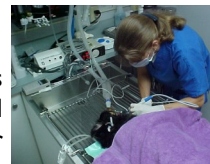
Cleaning teeth with an ultrasonic scaler.

Dental health is as important for pets as their owners. Our doctors will make recommendations as needed for your pet.